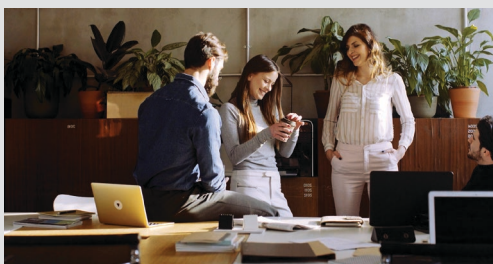
WHAT YOU SEE